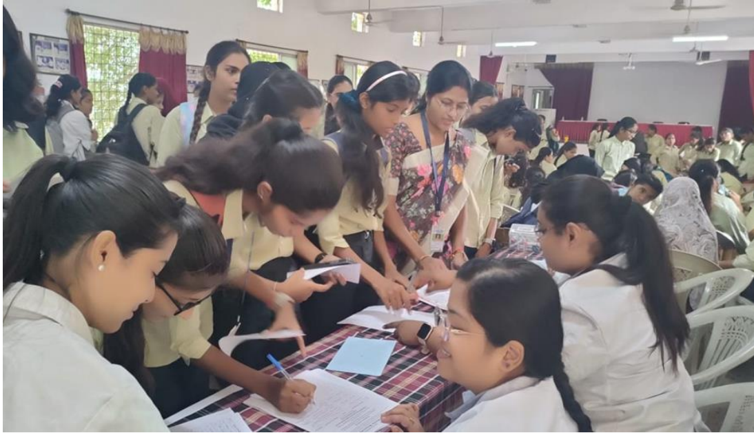
Student's registration counter - for Complete Blood Count estimation and Hemoglobin detection