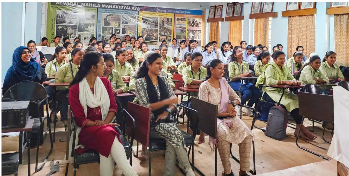
Staff members and students in the Guest lecture and Workshop.