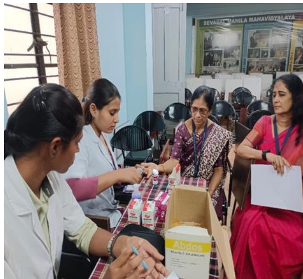
Blood sugar detection being performed during the health check-up camp