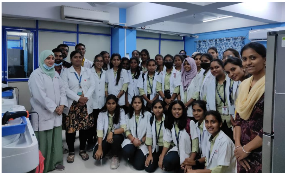
Students of B.Voc. third Semester, Faculty Member and Medcis Laboratory Technicians at Medcis Laboratory, Nagpur