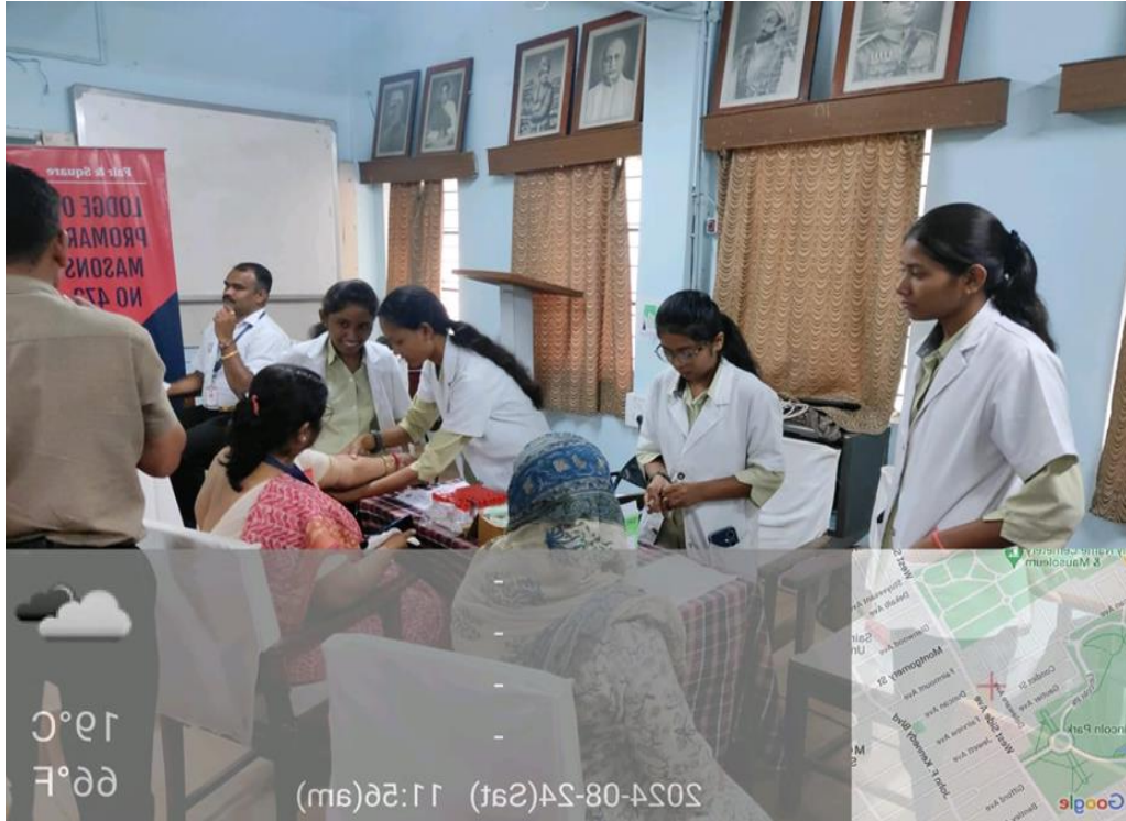
Student volunteers collecting blood samples for thyroid hormone estimation.